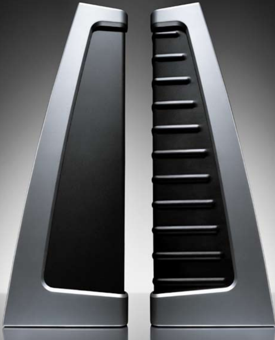
Flextight X1 and Flextight X5