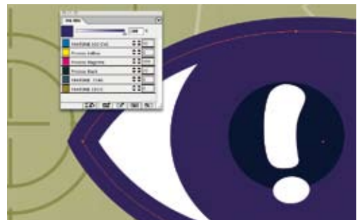
Use the full amount of available inks when making your job colors instead of only mixing the 4 process inks.