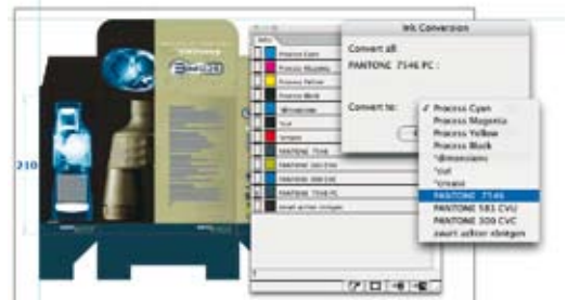
Get rid of any unwanted inks in no time and avoid wrong output by checking your separations beforehand.