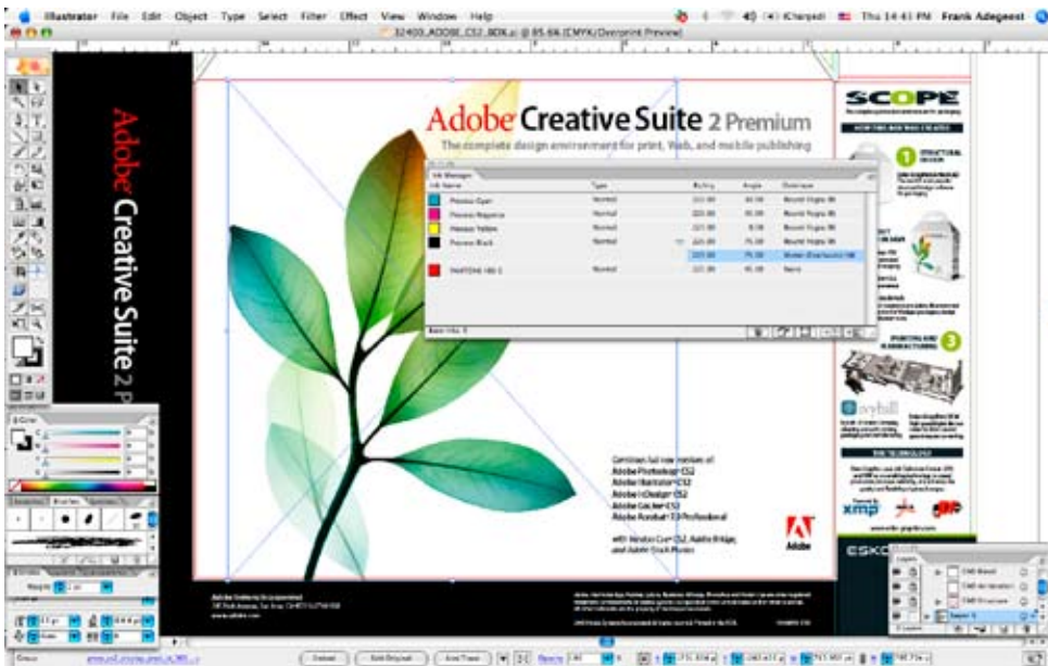
DeskPack's Ink Manager with an overview of the screening content of the Black separation.