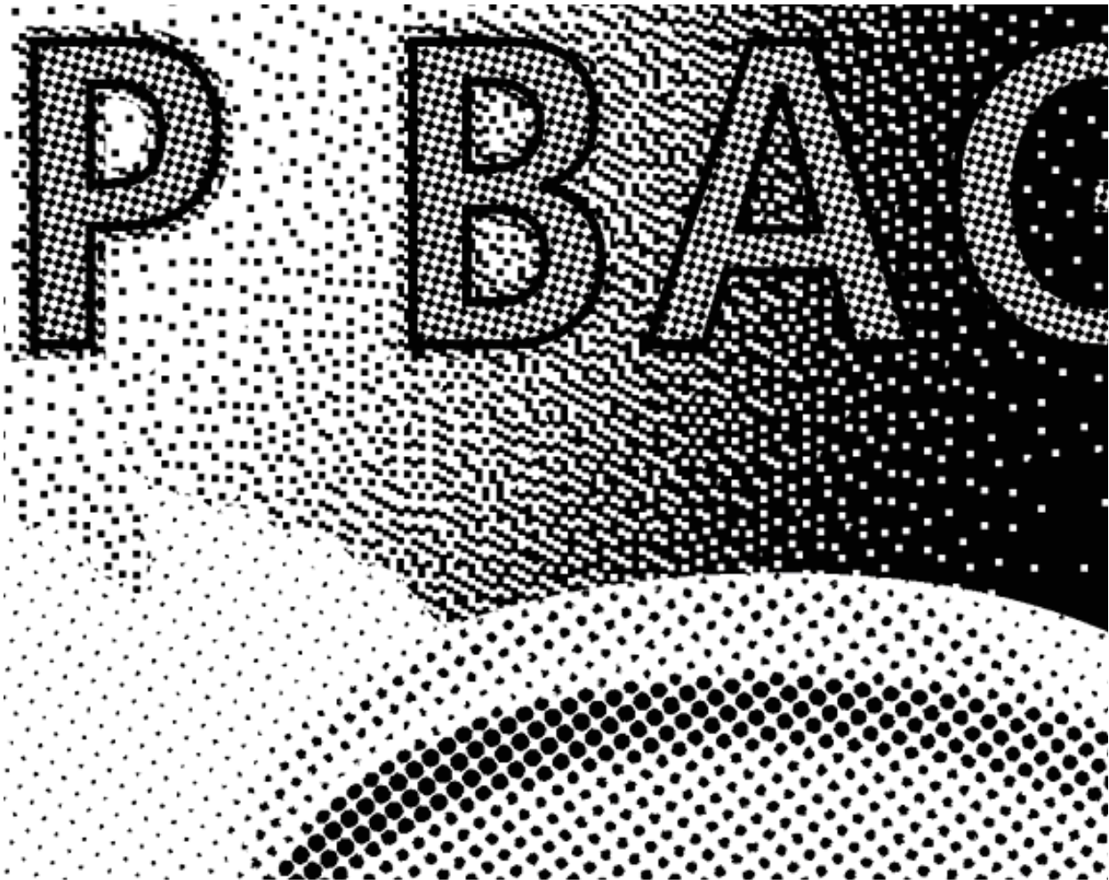
Example of a single separation containing multiple types of screening (circular, square and Monet).

The standard version of Adobe® Illustrator® can only provide one set of screen parameters (angle, ruling, dot shape) per ink/separation. screenX is a plug-in tool for Adobe Illustrator that allows object-based components to have multiple rulings and/or multiple angles or screening technologies within a single separation. The use of these mixtures is quite common in packaging jobs. screenX can also be used as a tool to apply specific DGC (Dot Gain Compensation) settings, a utility supported by the Esko FlexRip and the Agfa Apogee workflow systems.